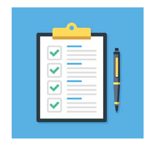
Start a checklist