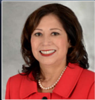
Hilda L. Solis First District

On September 24, 2019 the County of Los Angeles Board of Supervisors approved an Ordinance creating restrictions on the retail sales of tobacco products and tobacco paraphernalia, and a new Business License requirement.