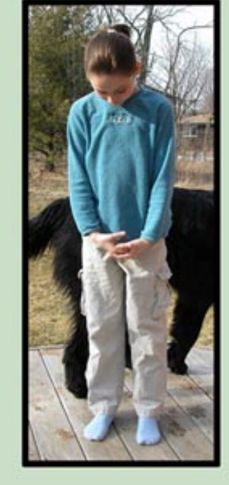
Watch your roots grow and count in your head