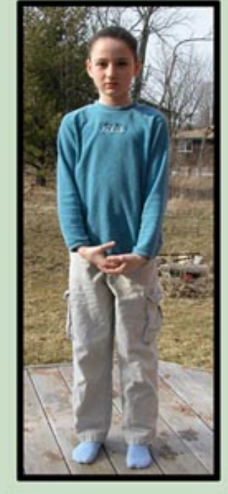
Fold in your branches